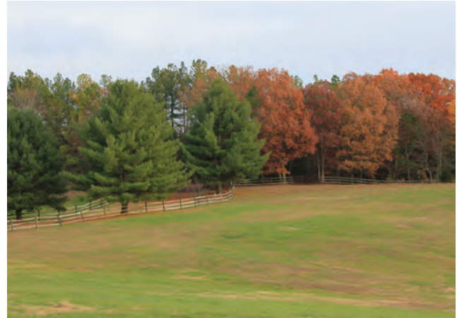
Verdant fields, inviting forests, and two large ponds are only a few of the features of this sprawling property.

Without any doubt, the new property combines great natural beauty with many practical advantages for Seminary life. Nevertheless, at the moment, its excellence as a seminary's grounds remains entirely in potentiality. The site is chosen and marked out. The land is cleared and prepared, but there is no Seminary yet. A seminary in a bad location is deficient, but the perfect location without any buildings is no seminary at all. Please support this building effort and help the Seminary improve and perfect the formation of traditional Catholic priests for the glory of God, for the future of the Church, and for the salvation of souls. ❖